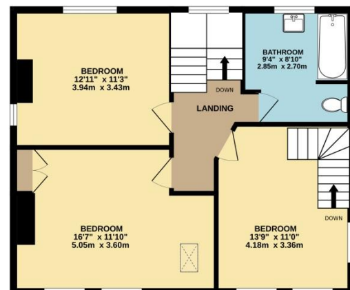
1ST FLOOR 625 sq.ft. (58.1 sq.m.) approx.