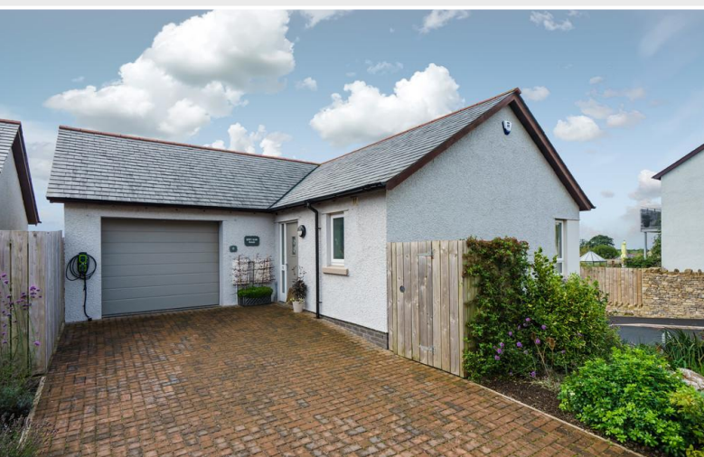
Garage and Parking

Rental Potential: If you were to purchase this property for residential lettings we estimate it has the potential to achieve between £1400 - £1500 per calendar month. For further information and our terms and conditions please contact the Office.