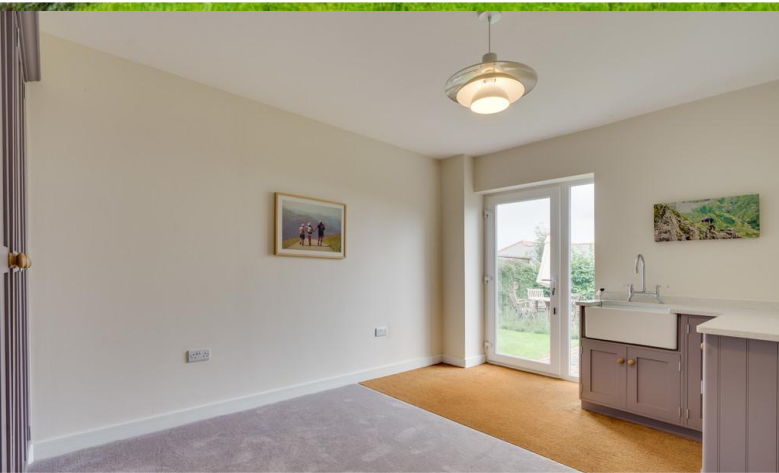
Bedroom 4 - Utility Room