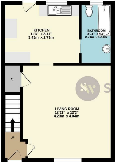
GROUND FLOOR 364 sq.ft. (33.8 sq.m.) approx.