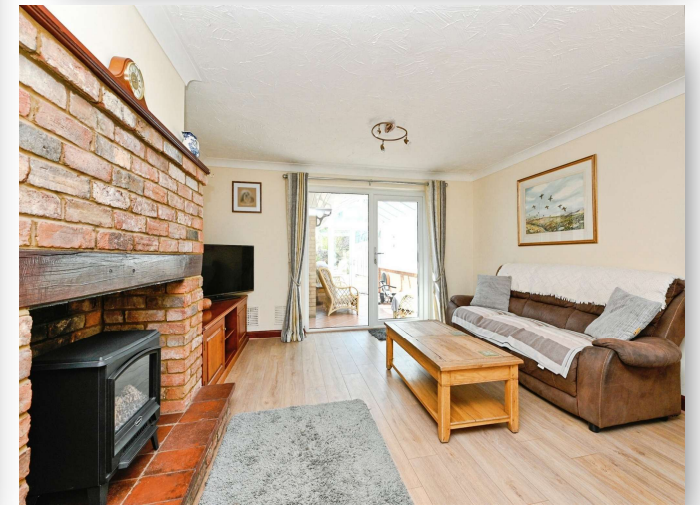
Foresters Avenue, Hilgay, Downham Market, PE38 0JU