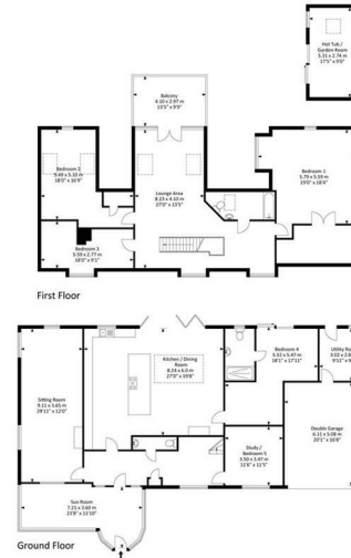
Lyndale, Over Lane, Almondsbury, Bristol, BS324DQ Approx. Area 3842.40 Sq.Ft - 357.0 Sq.M

For illustrative purposes only. Not to scale. Whilst every attempt has been made to ensure accuracy of the floor plan all measurements are approximate and no responsibility is taken for any error, omission or measurement. Floor plan produced by Energy Plus.