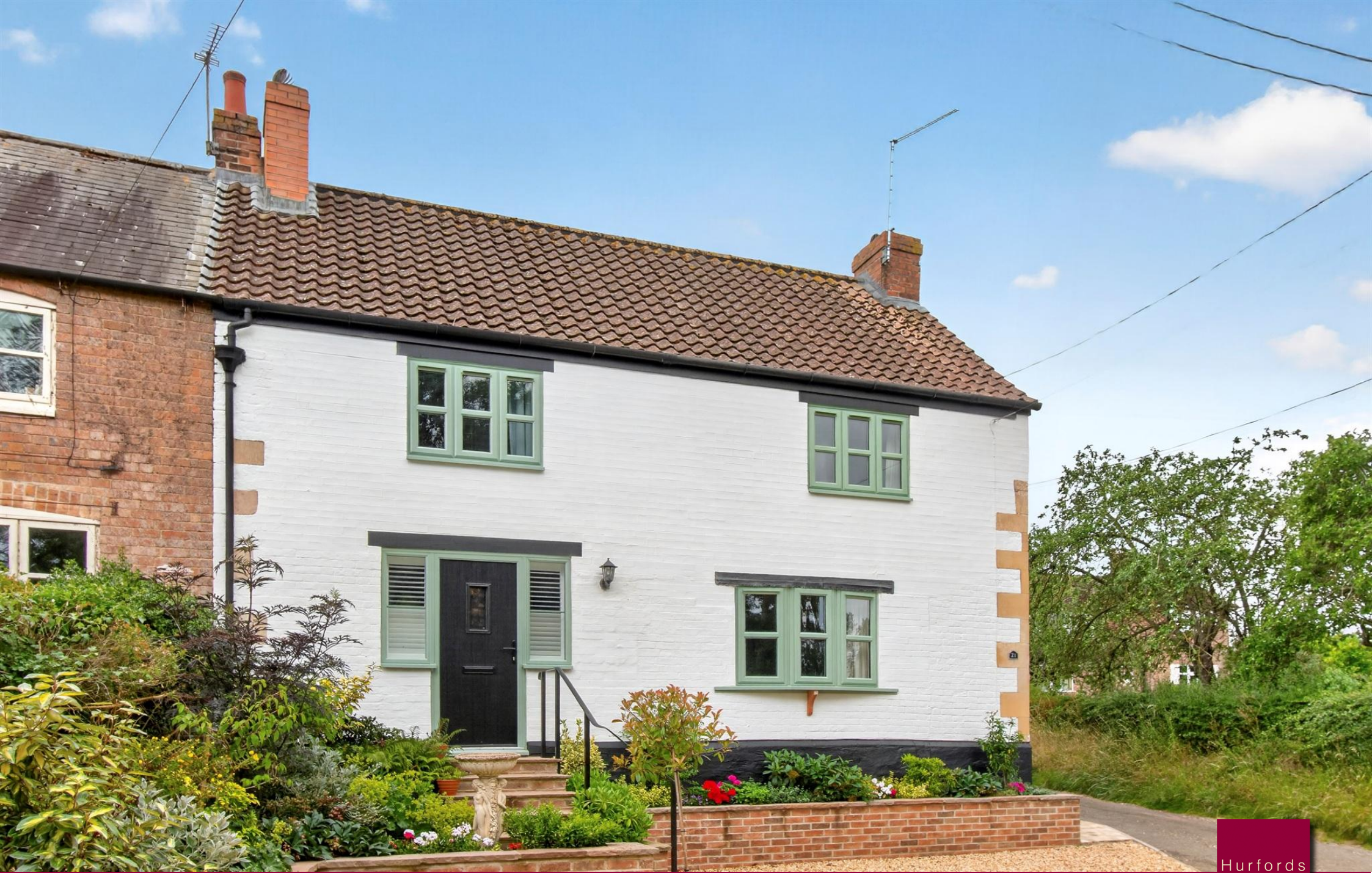
The Nook, Whissendine, Oakham Freehold OIEO: £375,000