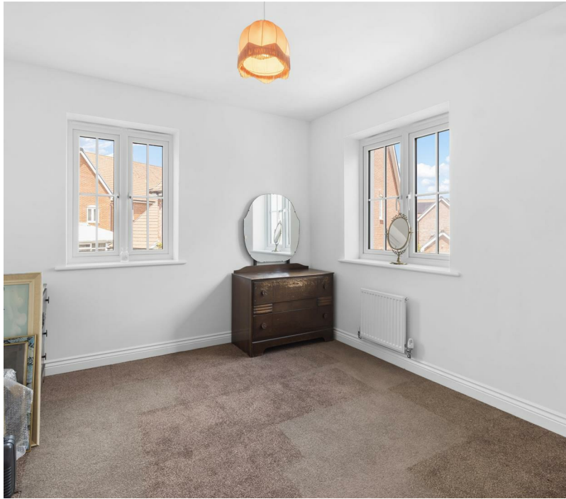
Hedley Way, Hailsham