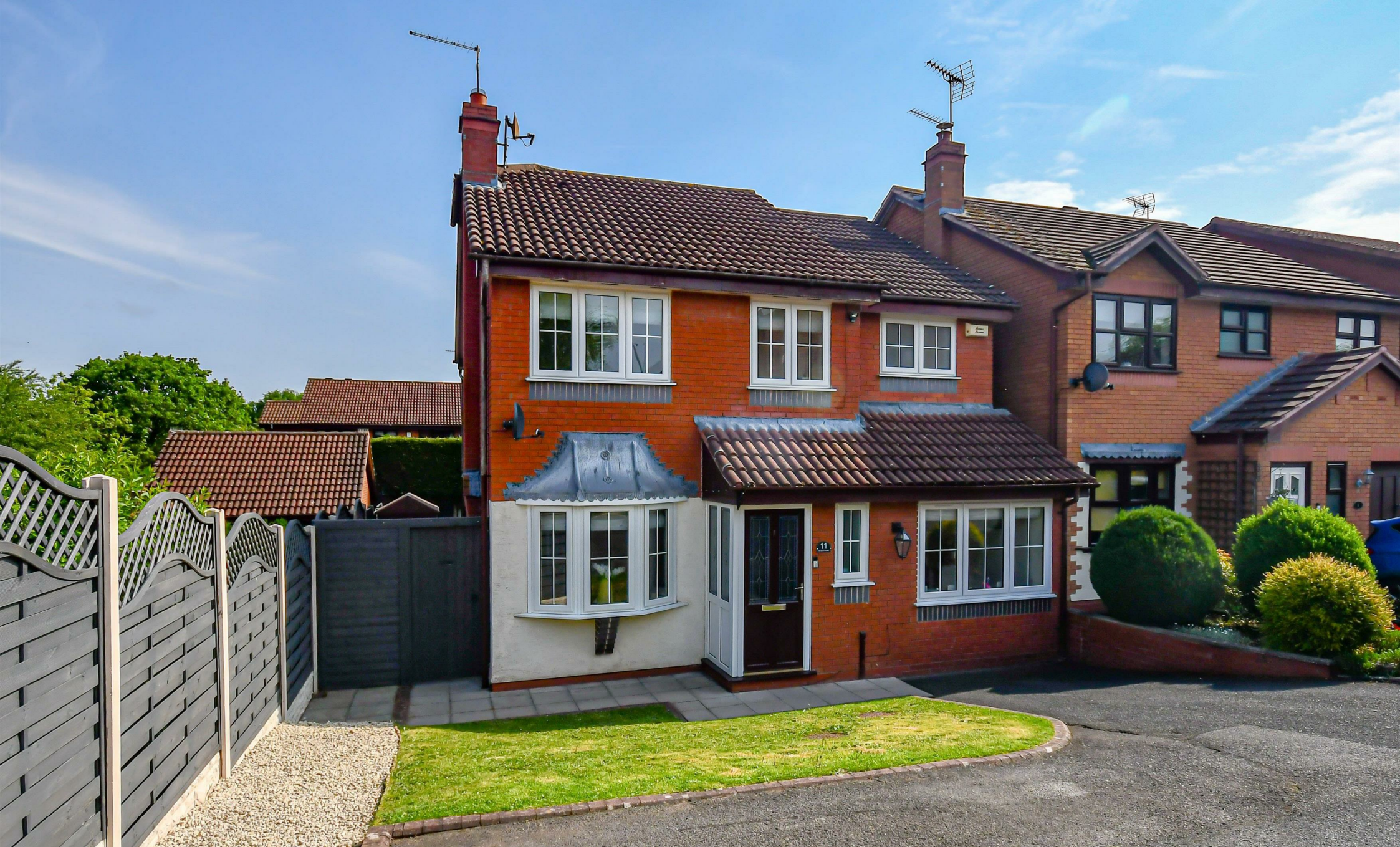
11 Penleigh Gardens, Wombourne, Wolverhampton, WV5 8EJ