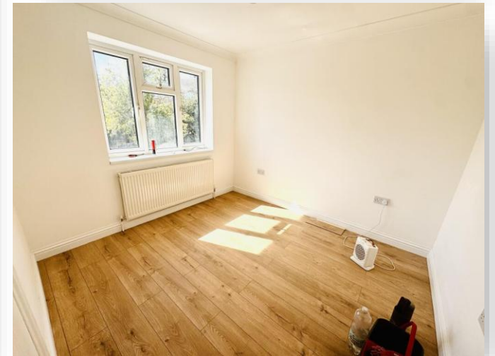
Kathleen Drive, Kettering NN16 0QG