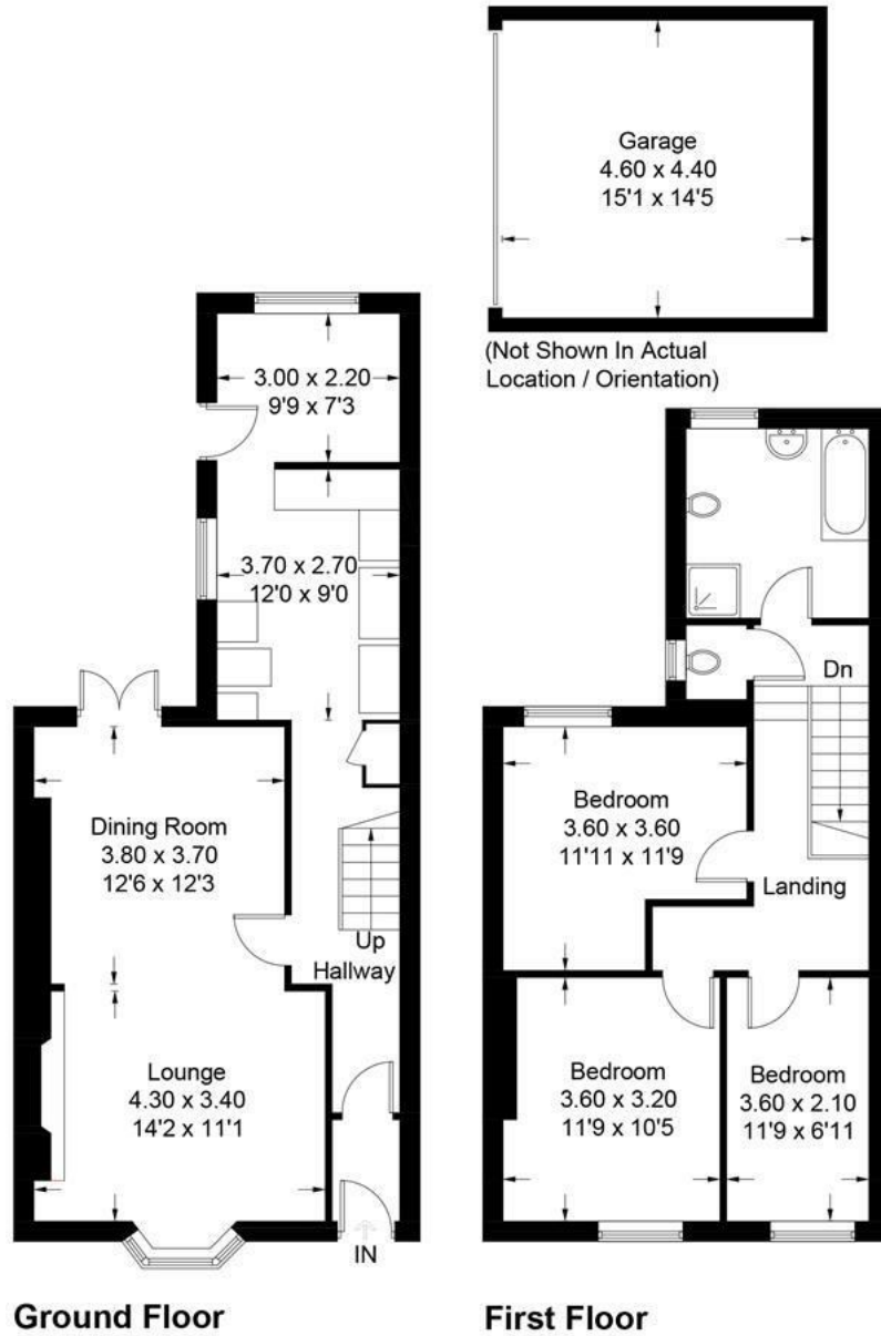
Illustration for identification purposes only, measurements are approximate, not to scale. Fourlabs.co © (ID1291677)

IMPORTANT: Stags gives notice that: 1. These particulars are a general guide to the description of the property and are not to be relied upon for any purpose. 2. These particulars do not constitute part of an offer or contract. 3. We have not carried out a structural survey and the services, appliances and fittings have not been tested or assessed. Purchasers must satisfy themselves. 4. All photographs, measurements, floorplans and distances referred to are given as a guide only. 5. It should not be assumed that the property has all necessary planning, building regulation or other consents. 6. Whilst we have tried to describe the property as accurately as possible, if there is anything you have particular concerns over or sensitivities to, or would like further information about, please ask prior to arranging a viewing.