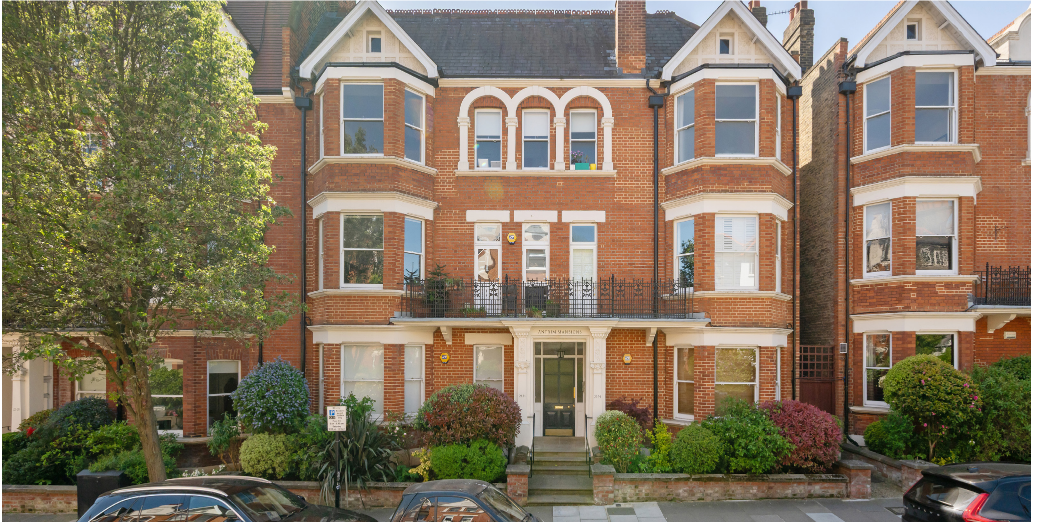
ANTRIM ROAD, London NW3