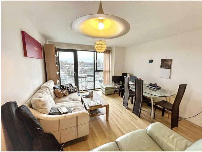
Balcony 6'3" x 11'6" (1.92 x 3.51)