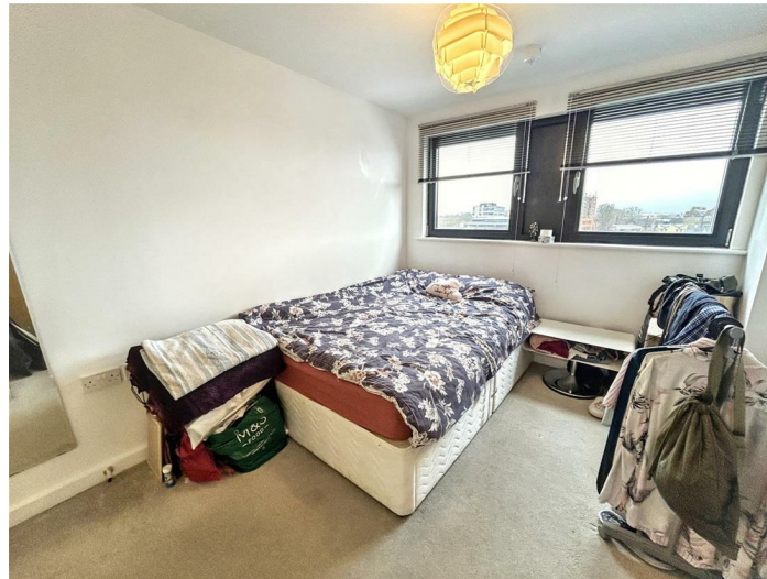
double glazed window - built in storage cupboard - wall mounted electric heater - power point - carpet to remain.