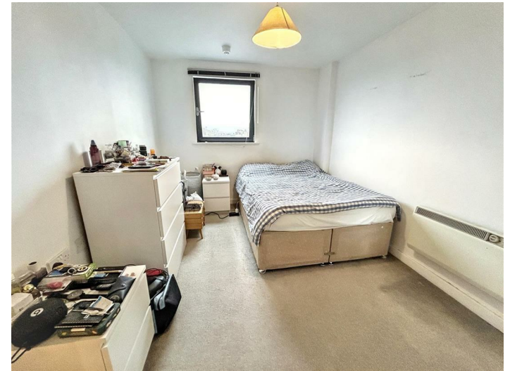
double glazed window - wall mounted electric heater - power points - carpet to remain.