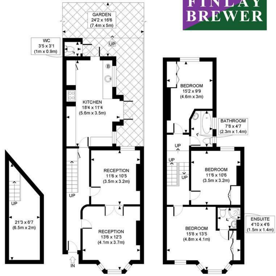
BASEMENT GROSS INTERNAL FLOOR AREA 115 SQ FT