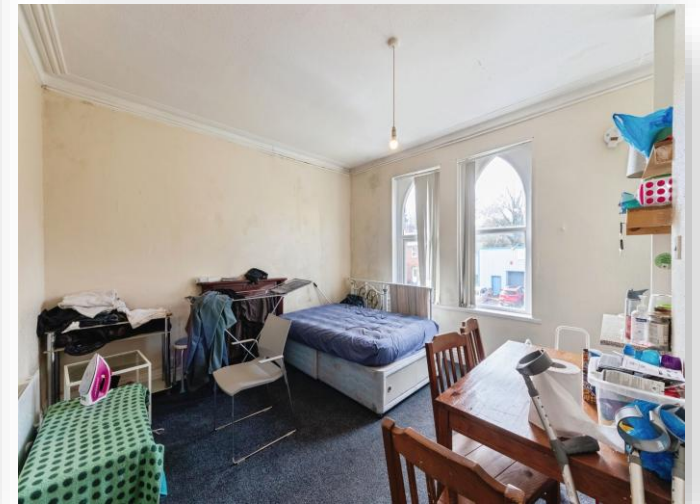
Station Road, Acocks Green Birmingham B27 6DN