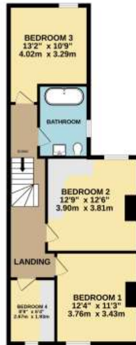
TOTAL FLOOR AREA: 1440 sq.ft. (131.7 sq.m.) approx.

While every attempt has been made to ensure the accuracy of the description contained here, measurements of areas, sections, rooms and any other items are approximate and no responsibility is taken for any error, omissions or mis-statements. This plan is for guidance purposes only and should be used in conjunction with any prospective purchaser. The services, systems and appliances shown have not been tested and no guarantee as to their operability or efficiency can be given. Made with: Mortgage Visuals