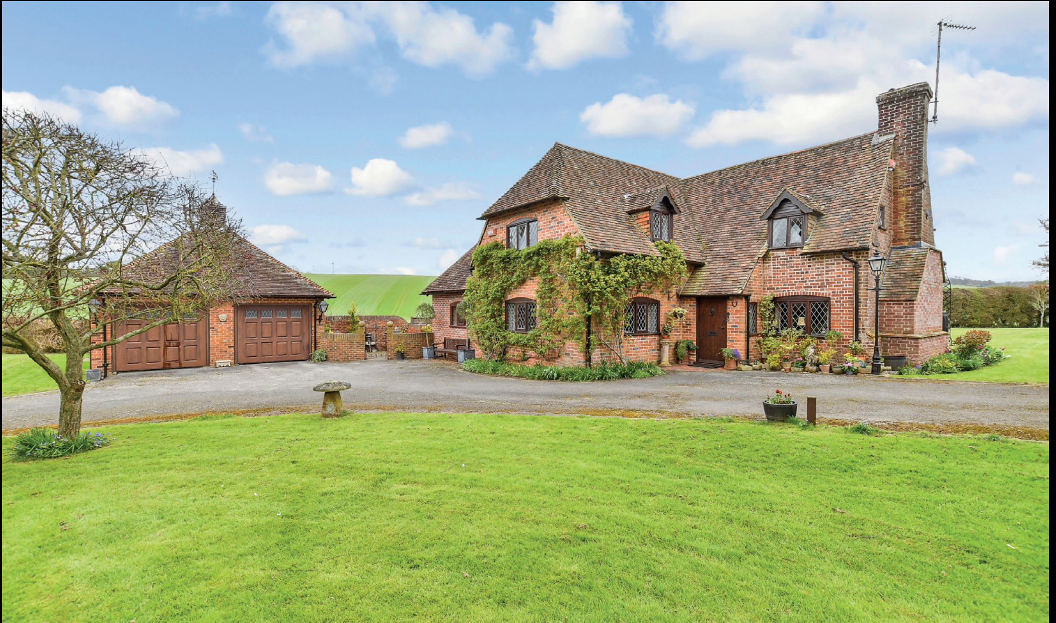
Dane Cottage Mystole Lane | Mystole | Canterbury | Kent | CT4 7BX