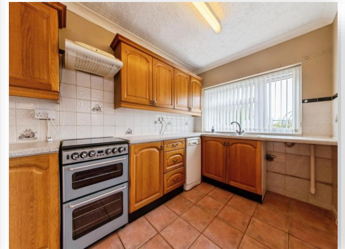
Rotten Row, Pinchbeck Spalding PE11 3RH