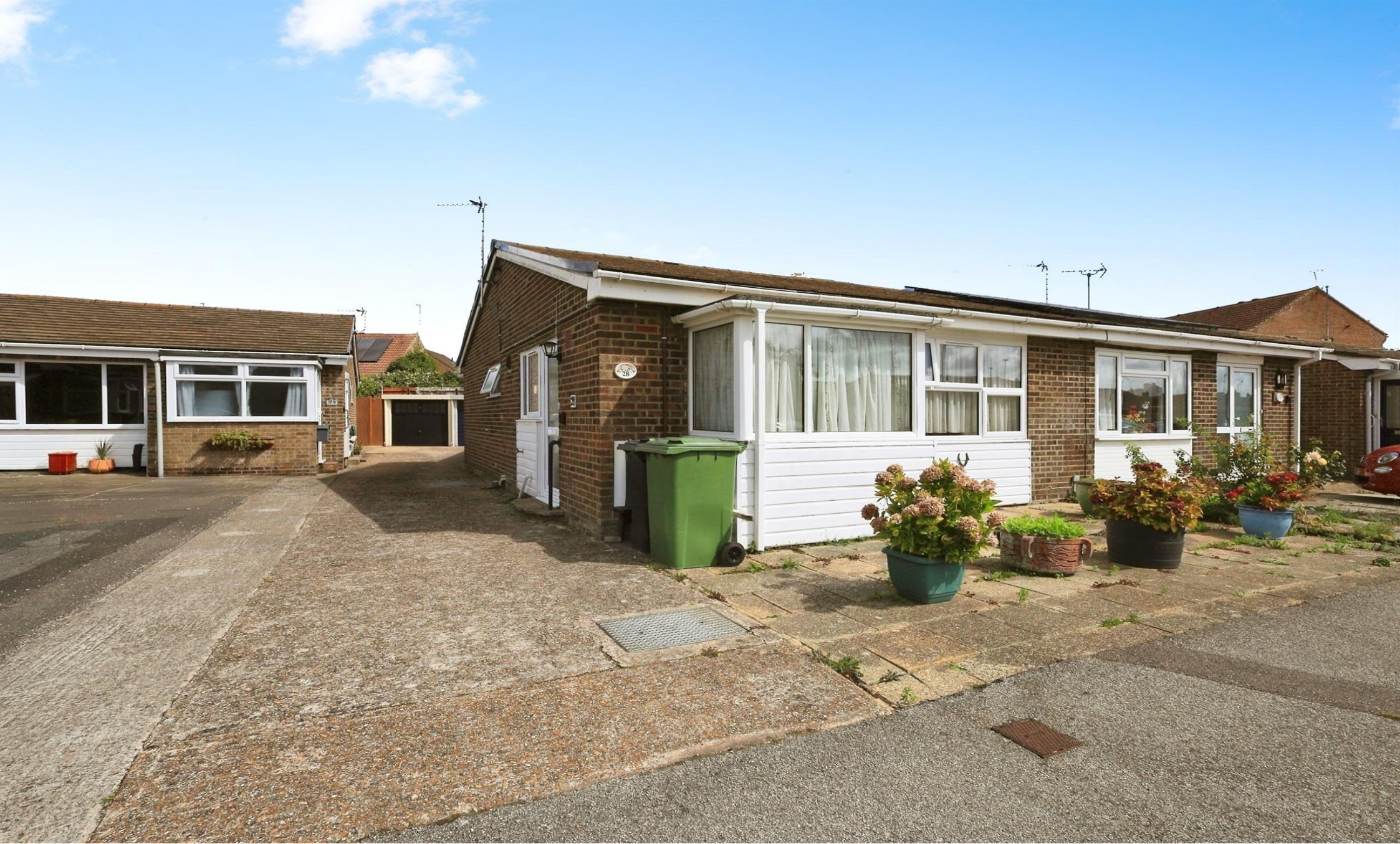
Old Orchard Place, Hailsham BN27 3HY