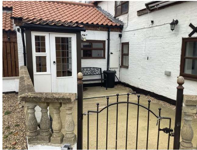
Enclosed porch, solid Oak entrance door, leaded light windows.