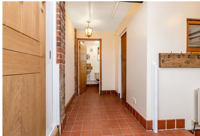
Quarry tiled floor, built-in cupboard, hatch to the single storey roof space.