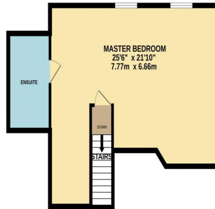
1ST FLOOR 538 sq.ft. (50.0 sq.m.) approx.