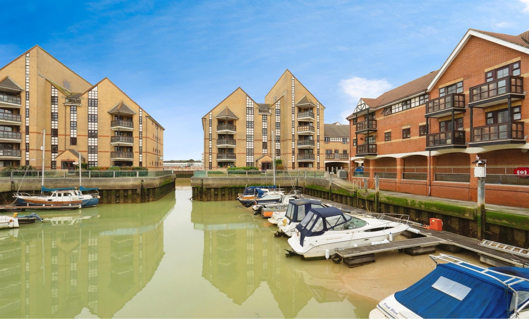
Marys Place Emerald Quay, Shoreham-By-Sea BN43 5JS