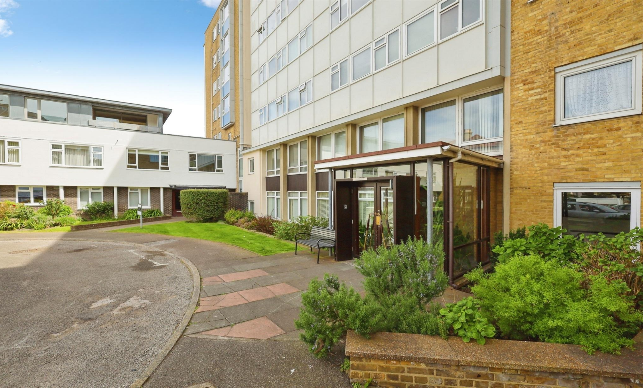
Park Gates Chiswick Place, Eastbourne BN21 4BD