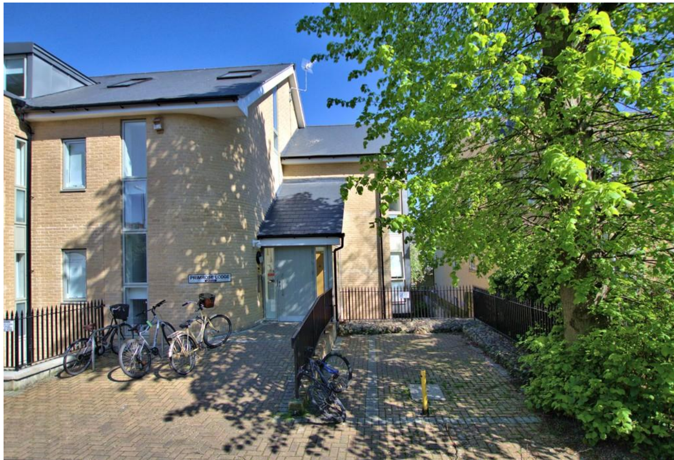
Primrose Lodge, Cambridge