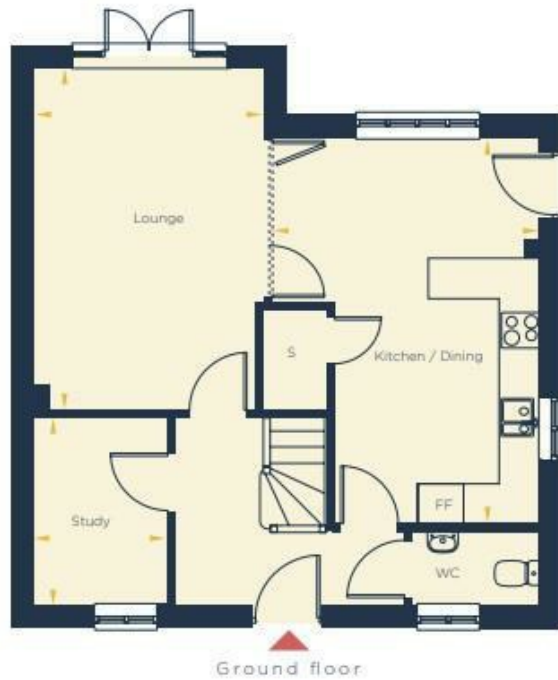
*Mirrored version of plan shown.