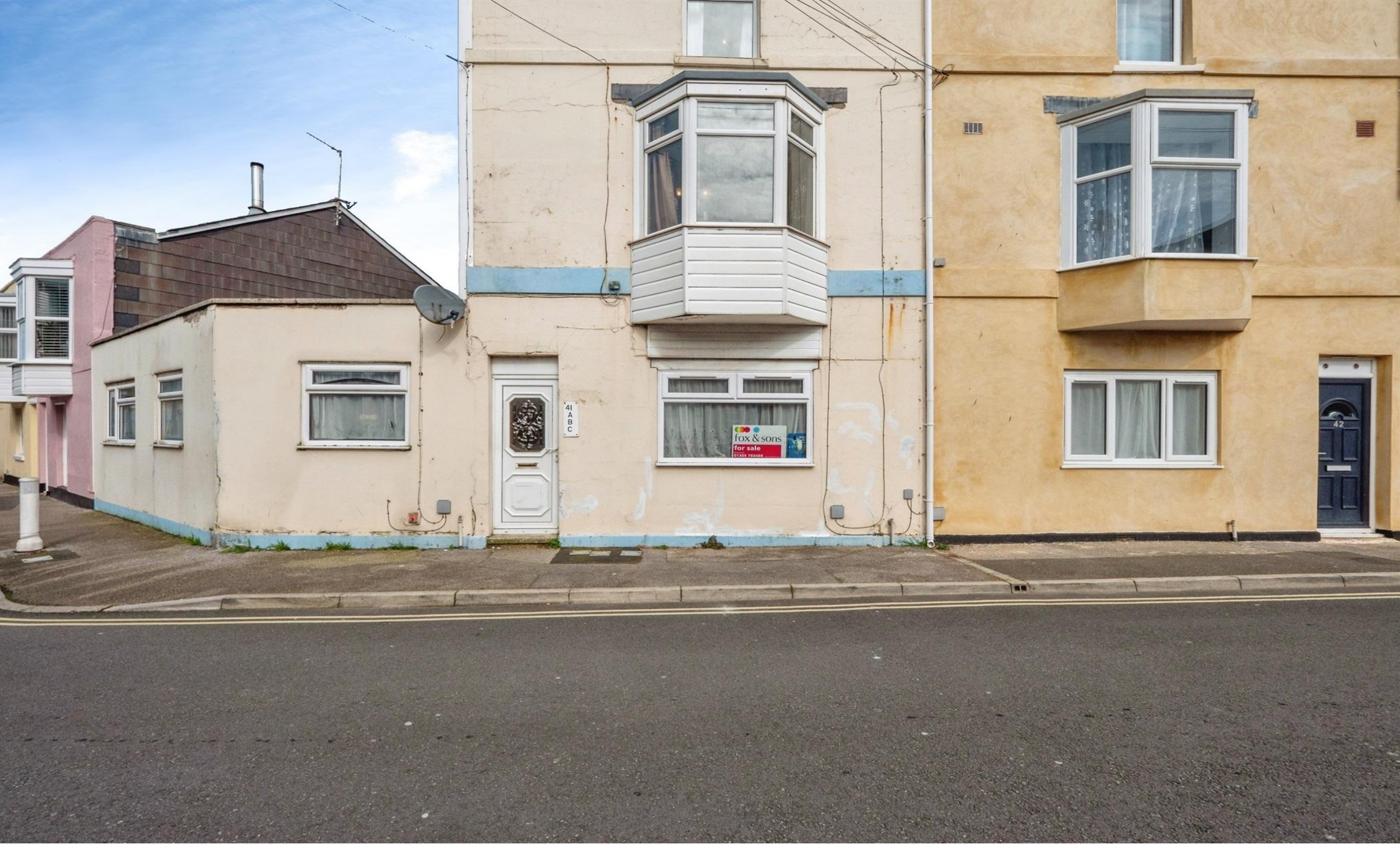
Hardwick Street, Weymouth DT4 7HS