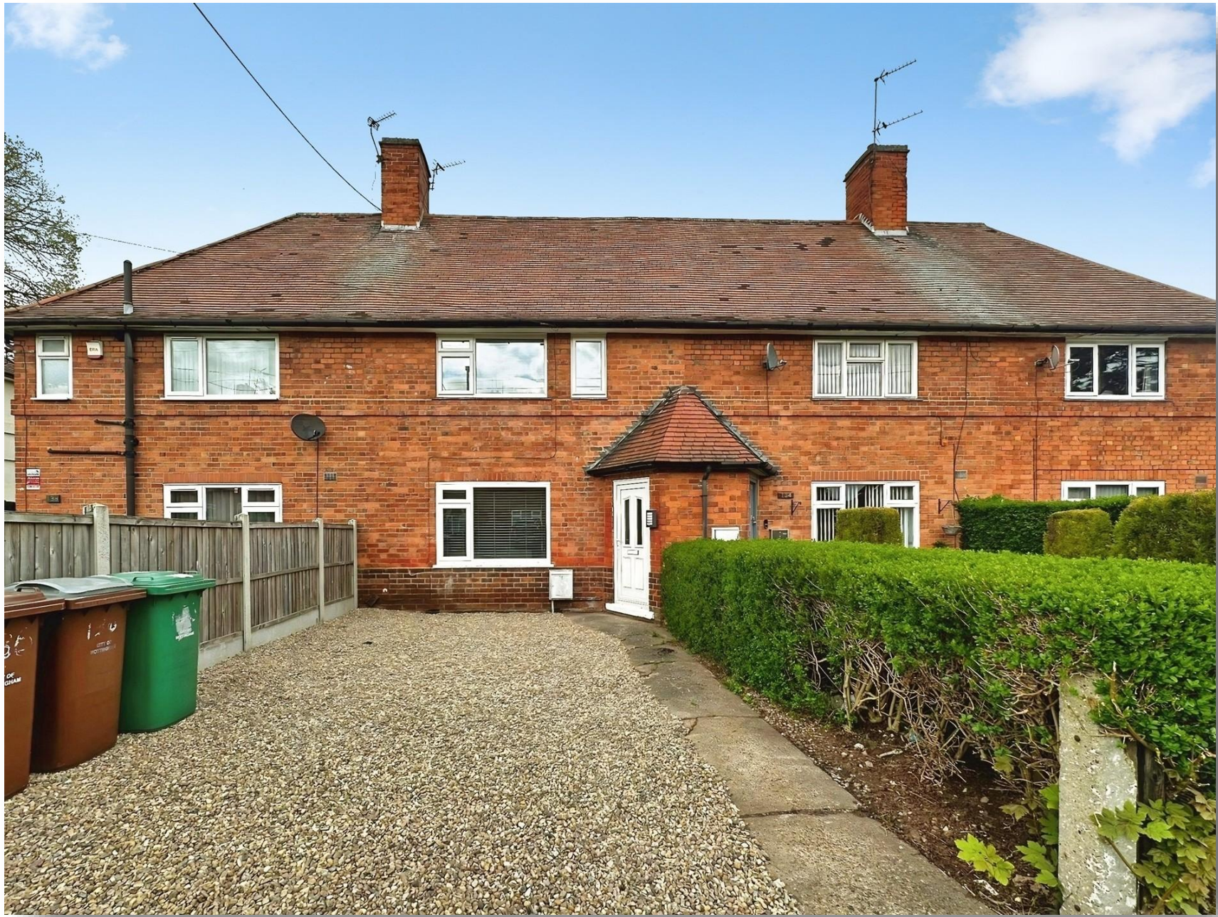
Allendale Avenue, Nottingham NG8 5RD