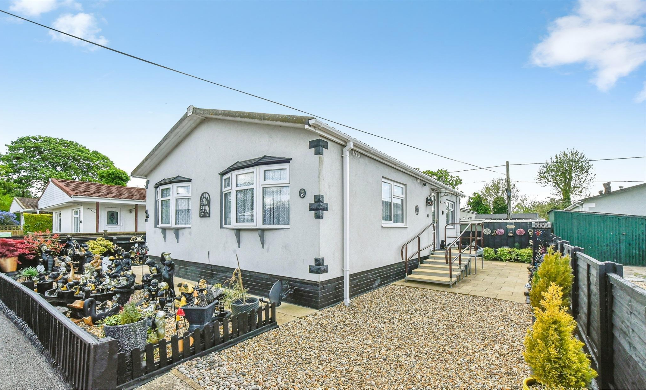
Priors Walk, St. Johns Priory Lechlade GL7 3HR