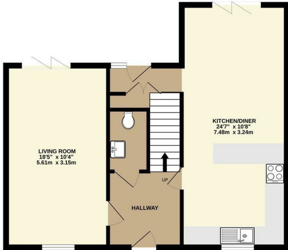
GROUND FLOOR 588 sq.ft. (54.7 sq.m.) approx.