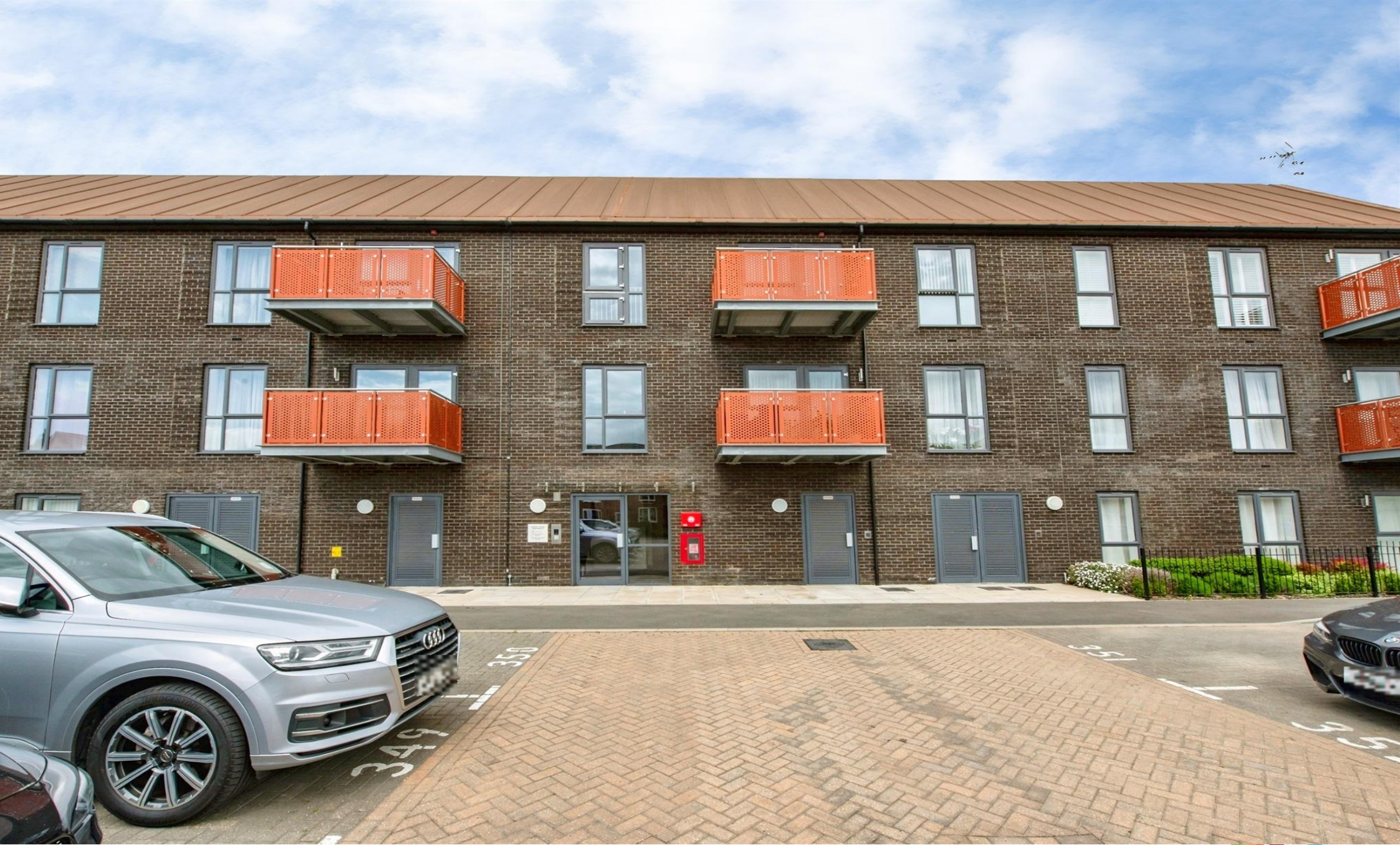
Dovestone Close, West Thurrock Grays RM20 3DF