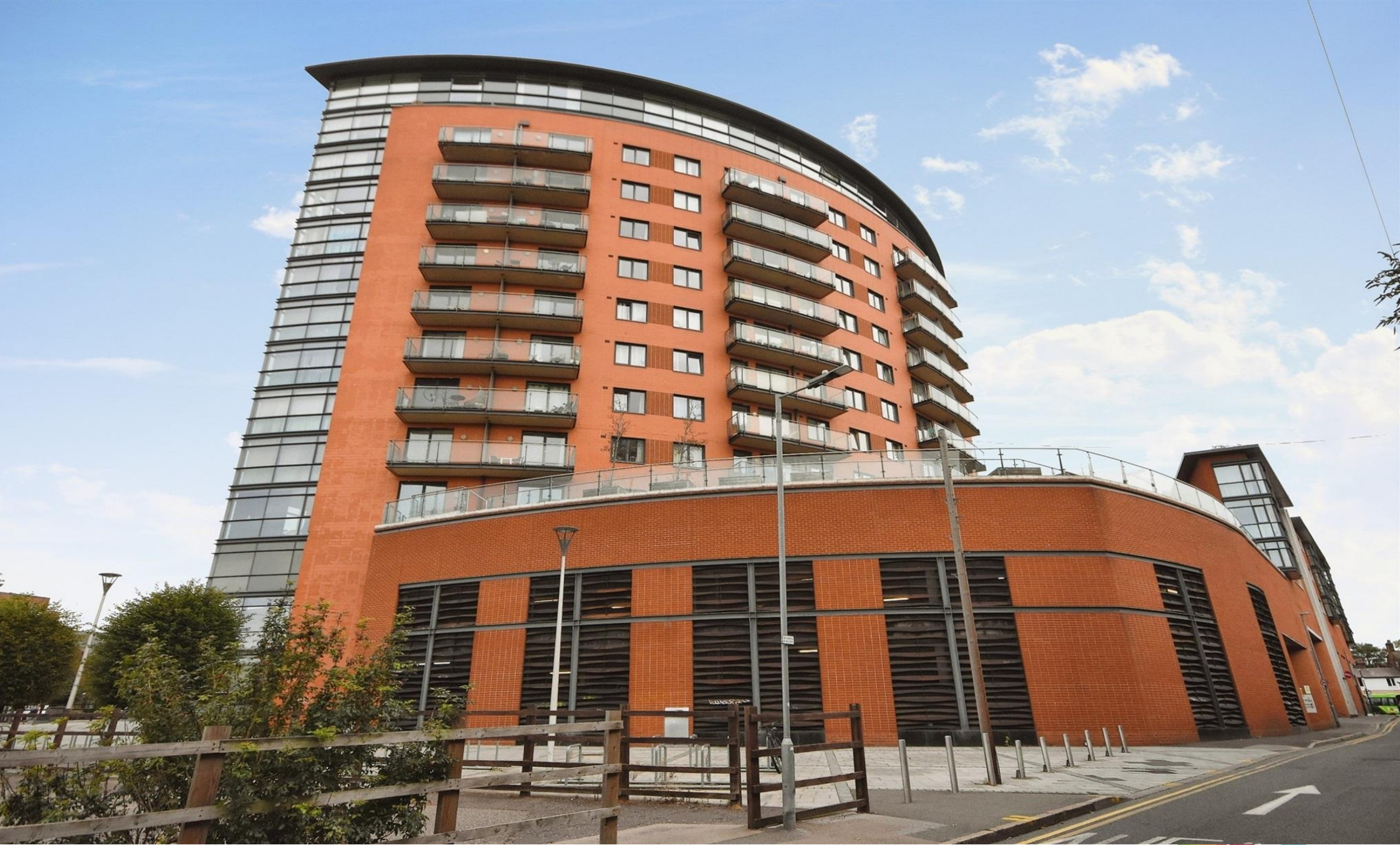
Wells Crescent, Viaduct Road, Chelmsford CM1 1GR