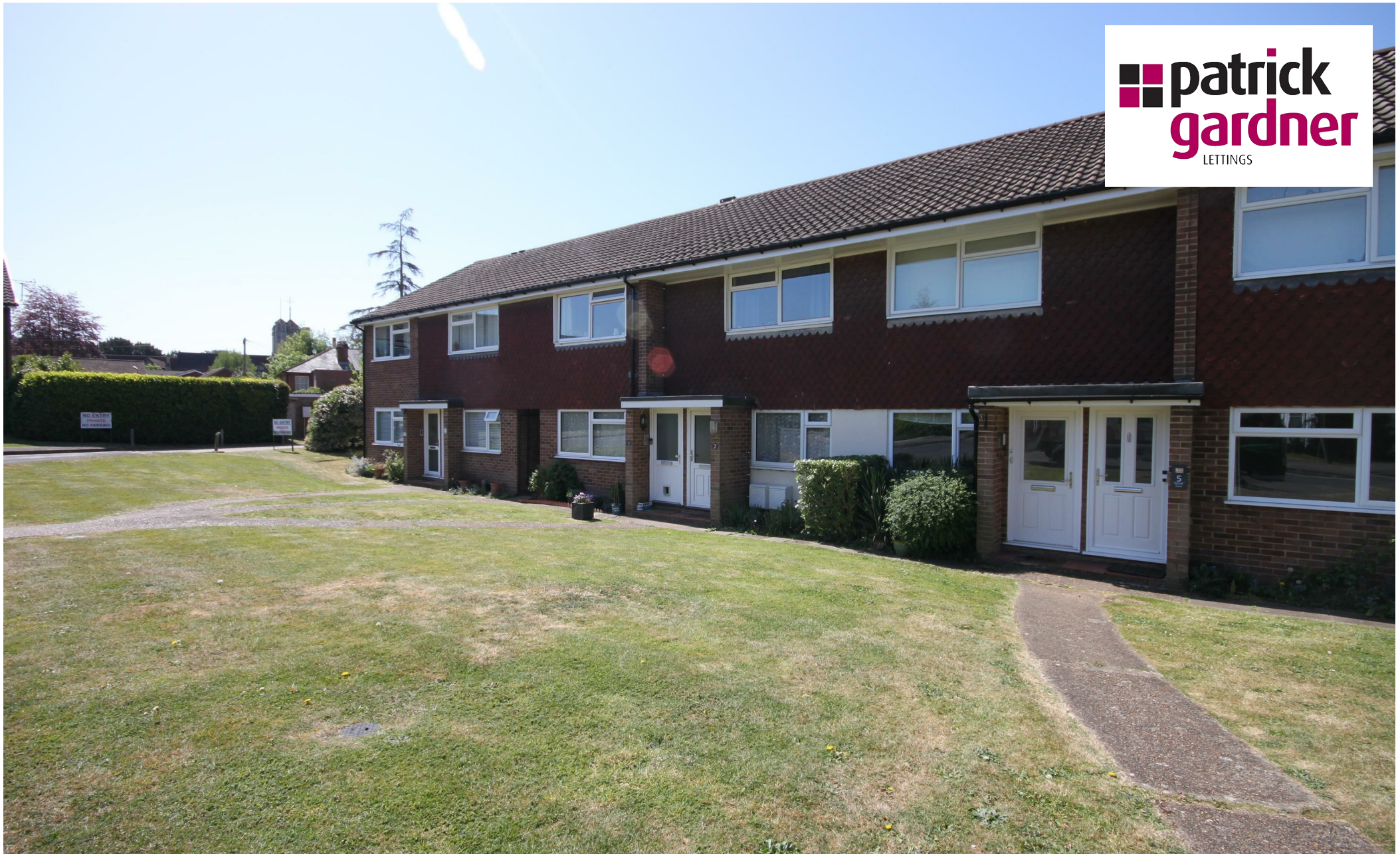
Russell Court, Leatherhead, KT22 8AR