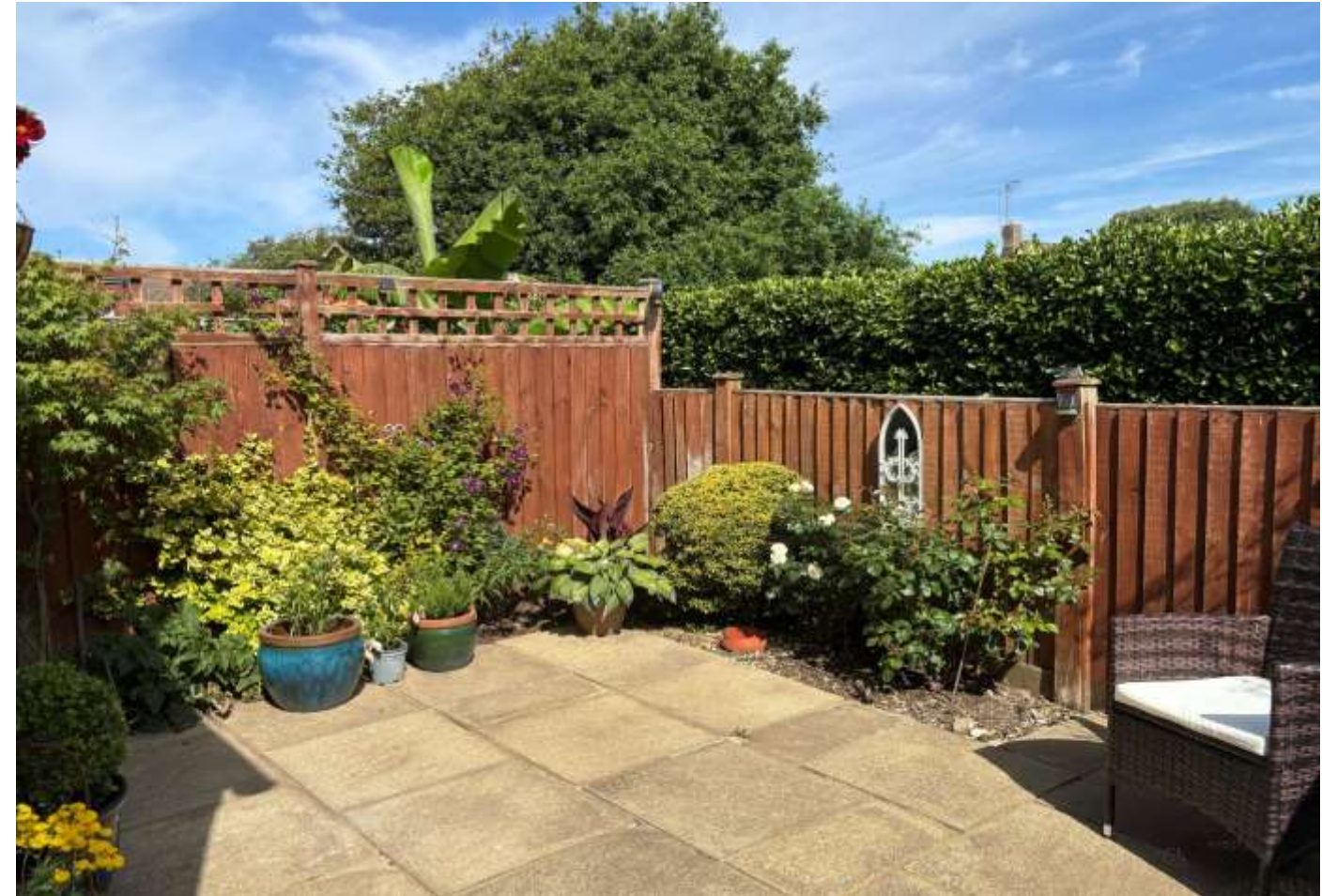
Front Aspect View

Public transport links are also close to hand, with several stops for the renowned 701 bus route operating through the village, whilst Angmering mainline railway station, which offers a regular service to London Victoria via Gatwick, is located in a distance of 2-miles.