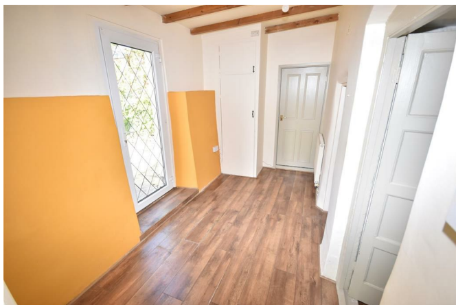
Rear Hall / Study 8'2" x 9'7"

Fully glazed UPVC door to the back patio, laminate flooring, original door to understairs walk in cupboard and another cupboard housing the boiler.