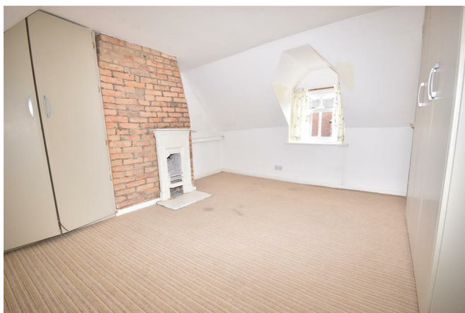
Bedroom One 11'11" x 11'5"

Window to front elevation, single radiator, carpeted flooring, spotlights in the ceiling, two fitted wardrobes and a draw unit.