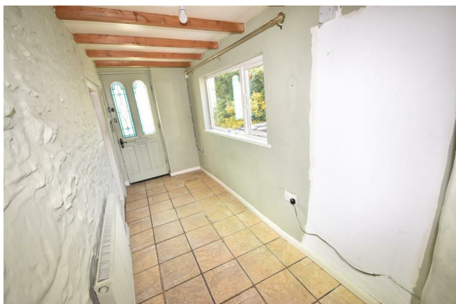
Rear Entrance Hall 4'11" x 12'9"

Window to the rear elevation, single radiator, upper glazed wooden door with stained glass panels, and beamed ceiling.