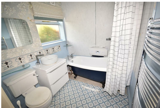
Bathroom 6'10" x 6'7"

Having a window to the rear elevation with frosted glass, Victorian styled tiled flooring, close coupled W.C., a modern round sink with 2 draw vanity unit underneath and chrome mixer tap, extractor, a roll top bath with chrome mixer tap, disabled relaxer electric unit for ease of entry and exit, a chrome heated towel rail, a shower mixer valve on the wall, mermaid boarding to two of the elevations and a circular shower rail.