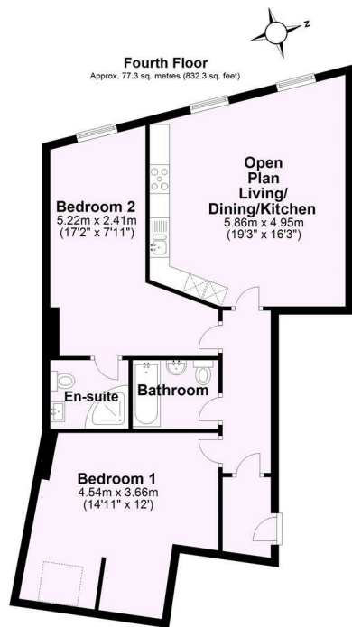
For Illustrative Purposes Only - not to scale Plan produced using PlanUp.