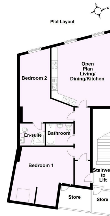
For Illustrative Purposes Only - not to scale Plan produced using PlanUp.