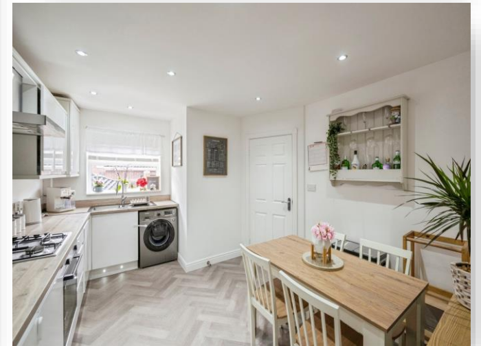
Blackthorn House The Poplars, Conisbrough Doncaster DN12 2PB