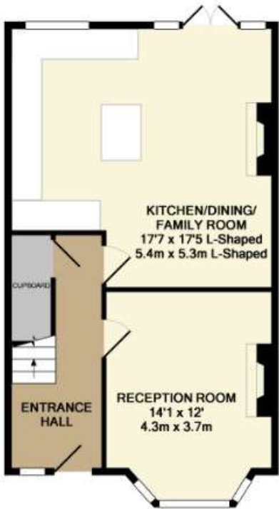
GROUND FLOOR APPROX. FLOOR AREA 532 SQ.FT. (49.5 SQ.M.)