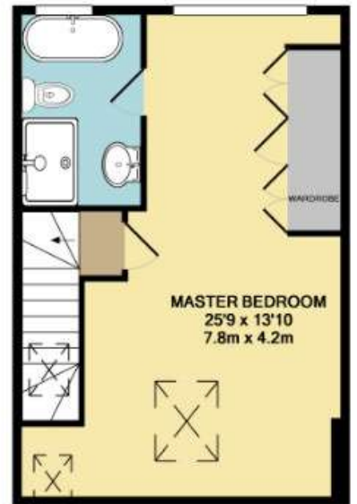
2ND FLOOR APPROX. FLOOR AREA 440 SQ.FT. (40.9 SQ.M.)

TOTAL APPROX. FLOOR AREA 1505 SQ.FT. (139.8 SQ.M.)