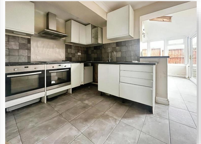
Egret Crescent, Colchester, CO4 3TX