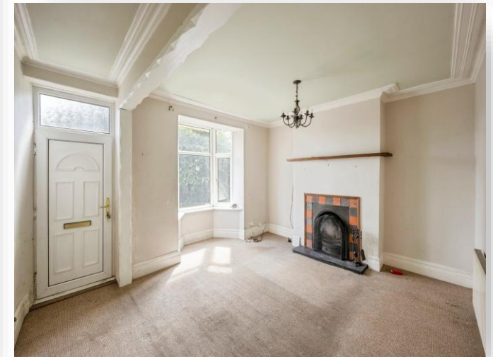
Highthorn Road, Kilnhurst Mexborough S64 5UU