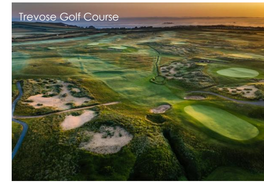
Trevose Golf Course