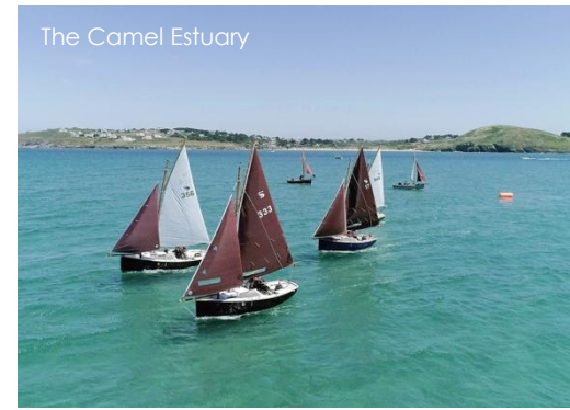
The Camel Estuary