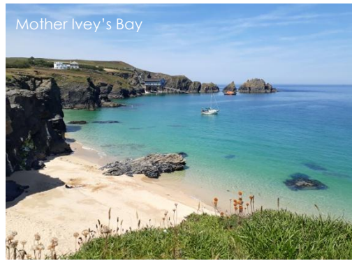
Mother Ivey's Bay