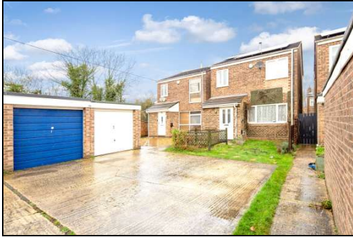
Front (Right-hand house) & Garage (Blue door)