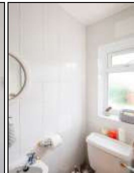
Rear Hallway & Cloakroom