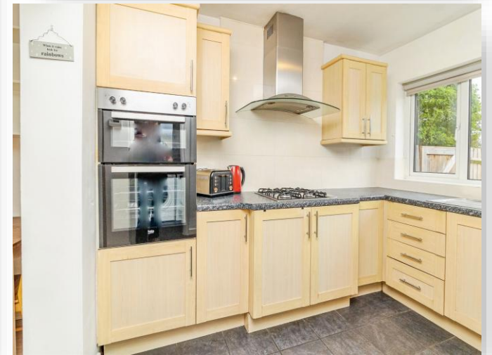
Tickford Street, Newport Pagnell, MK16 9BH