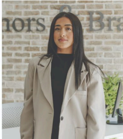
Meet Ayesgul Aftersales Progressor