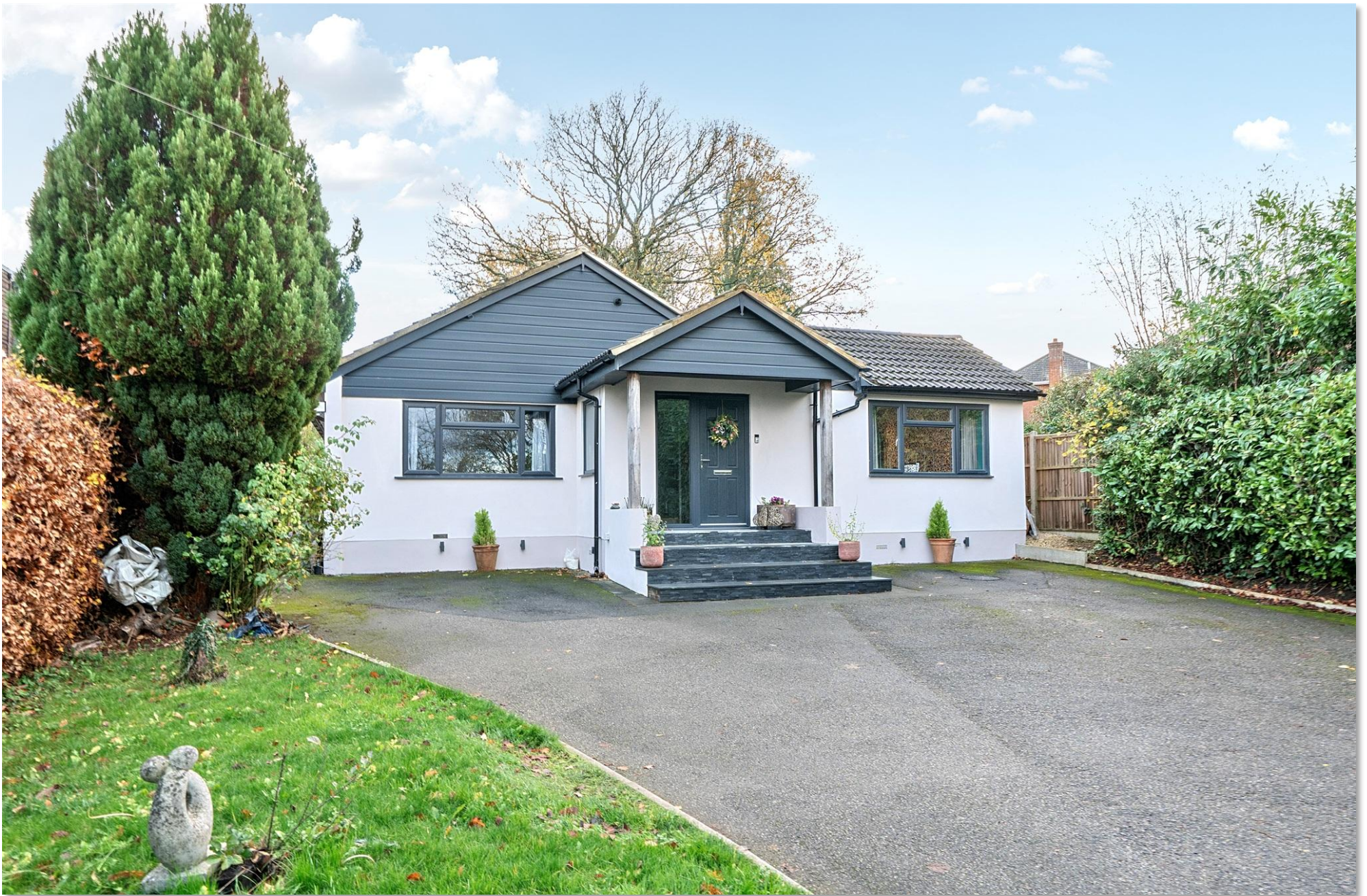
Rambling Way, Potten End Berkhamsted HP4 2SE