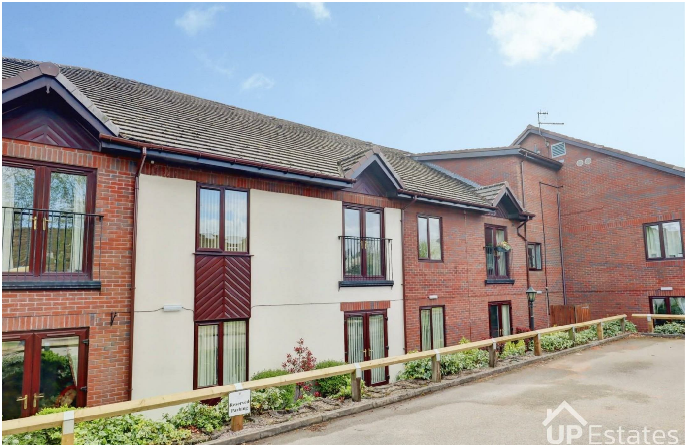
Bede Villiage, Hospital Lane, Bedworth