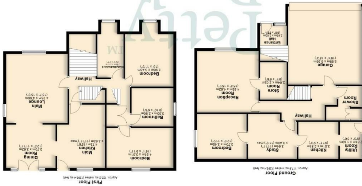
First Floor Approx. 120.2 sq. metres (1293.4 sq. feet)