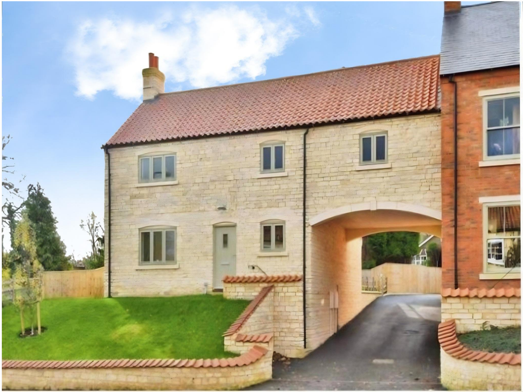
Lincoln Road, Branston Lincoln LN4 1PE