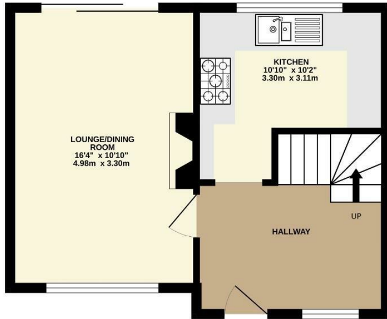
GROUND FLOOR 374 sq.ft. (34.7 sq.m.) approx.