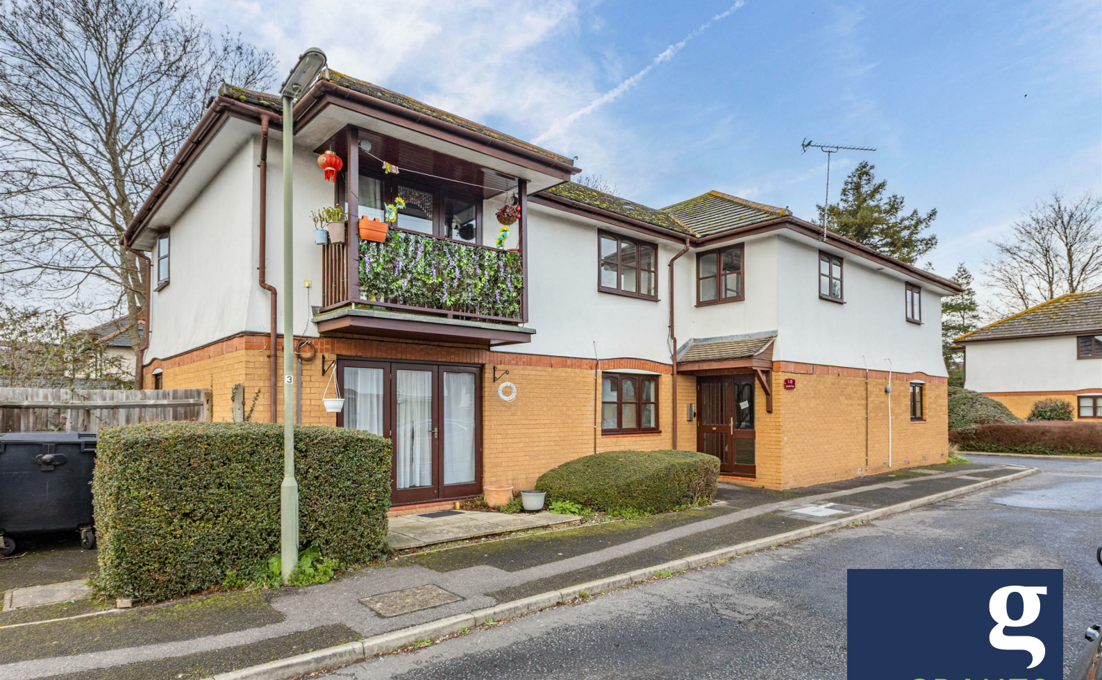
Joinville Place, Addlestone, KT15 2HP