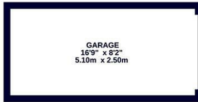
OUTBUILDING 137 sq.ft. (12.7 sq.m.) approx.