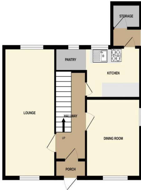
GROUND FLOOR 506 sq.ft. (47.0 sq.m.) approx.